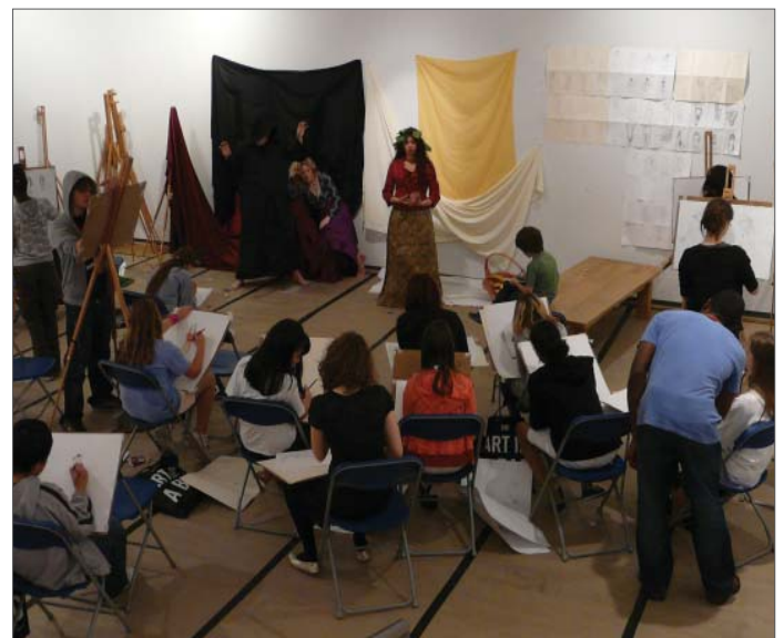
Students on The Drawing Marathon at The Mall Galleries